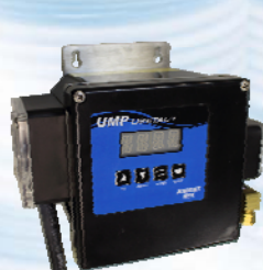
UMP Digital 200D 2 Product