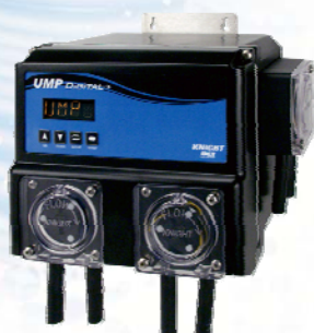
UMP Digital 300L 3 Product