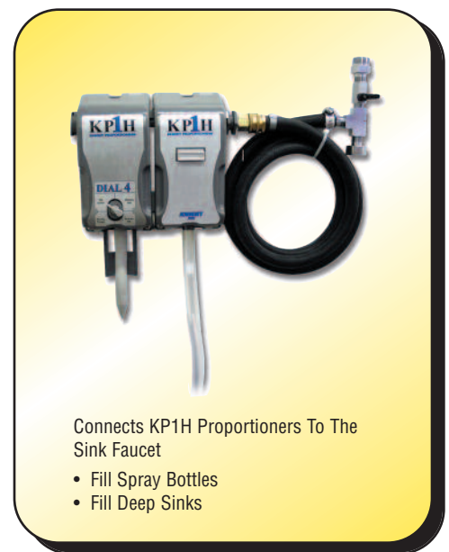
Connects KP1H Proportioners To The Sink Faucet