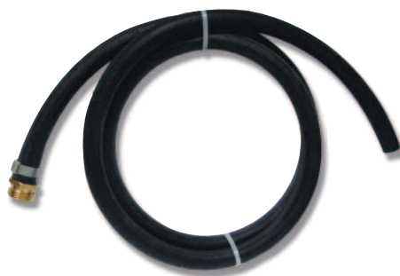
High Pressure Hose - 6 Ft.