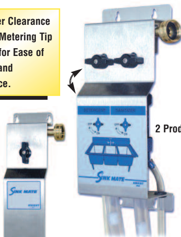
2 Product Sink Mate