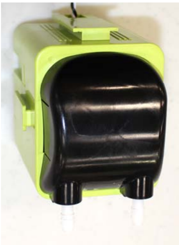
Peristaltic Pump Module

The OP Hospitality operates with a new, compact, modular pump module. Each pump module is individually encased and consists of two main parts: the motor housing and the snap off roller block. This design simplifies servicing and reduces inventory sku's. Replacing wear parts can be done in seconds without the need for tools.