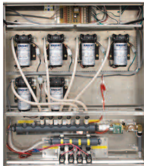
Chem-trak Jr. pump cabinet for EDP pumps