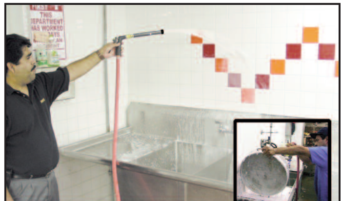
The foaming wand produces a rich foam that clings to surfaces to enhance cleaning results.