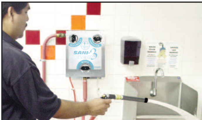
New foaming wand throws foam up to 5 feet. To operate, simply turn actuator valve, aim and pull spray gun trigger.