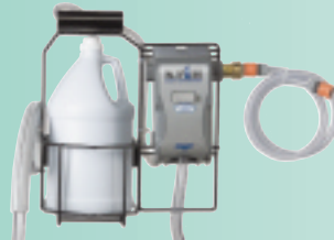
KP1H Bucket Fill Proportioner with "Easy-Lock" Button - Dispense one cleaning product to a mop bucket, Buddy jug, floor machine or auto scrubber at the touch of a button.