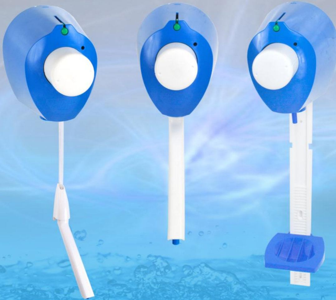
DosaMAX Jr. Bucket Fill

The DosaMAX Jr. is a simple and accurate hand pump designed to dispense concentrated chemicals to your sink/bottle/bucket. With incremental 5 ml dosing amounts, the DosaMAX Jr. accurately dispenses higher concentrated solutions. The DosaMAX Jr. highly chemical resistant materials and broad range of selectable dosing amounts allows the dispenser to accommodate a wider range of applications and chemicals.